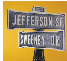
ADMIRAL A2-236 23"x 6" Four-way twin post top with inset top

Aluminum blade signs with vinyl lettering