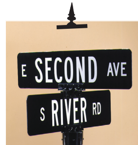
DRAKE D2-246 24"x 6" Four-way twin post with spike