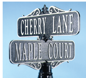
GATEWAY G2-256 25"x 6" Four-way twin post with cap