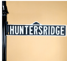
SHERIDAN S214 21"x 4" Two-way side-mounted with cap

CH3610 36"x 10" CH2810 28"x 10" CH2410 24"x 10"