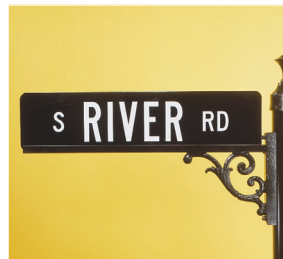
BROADWAY B246 24"x 6" Two-way side mounted

Aluminum blade signs with vinyl lettering