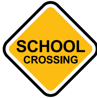
D36 Sign Frame