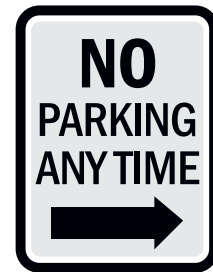
RV1218 Sign Frame