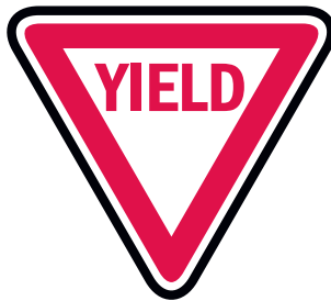
T30 Sign Frame