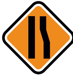
D24 Sign Frame