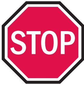
030 Sign Frame