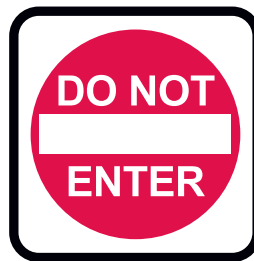
S24 Sign Frame