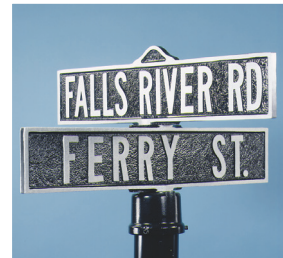
SHERIDAN S2-214 21"x 4" Four-way twin post top with cap