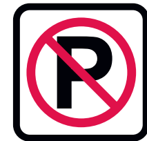
S18 Sign Frame