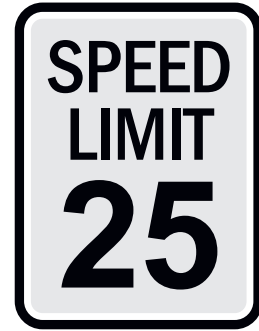
RV1824 Sign Frame