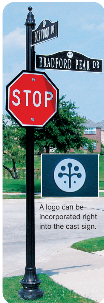
A logo can be incorporated right into the cast sign.

These rich-looking aluminum street signs will add a distinct identity to your street or your new subdivision. Signs may be post-top mounted or side-mounted. Signs are fully cast aluminum with raised letters, extruded aluminum blade signs with vinyl lettering or cast aluminum with vinyl lettering. Cast signs are powder coated in an extremely reflective paint, and feature tall, easy to read lettering. Sizes and shapes to meet your requirements.