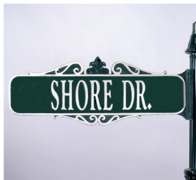
GATEWAY G-256 25"x 6" Two-way side-mounted with cap