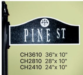
CHERRY HILL 3 Sizes Two-way side-mounted with cap

CH3610 36"x 10" CH2810 28"x 10" CH2410 24"x 10"