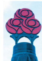
Custom post top cap as shown above.

Traffic Signs can be mounted on many of the Sternberg straight, fluted or smooth, cast aluminum, or concrete poles. The R5-1-24 DO NOT ENTER sign is set in a S24 frame and mounted on our 3710FP4 pole with a custom Roselle "rose" finial center cap.