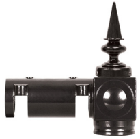
HSCS Hangstraight, clamp style, SPIKE Finial