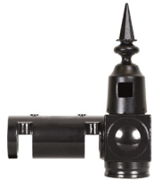
HSCS-R-PE Hangstraight, clamp style with SPIKE finial, twist-lock receptacle, photocell in decorative cap.