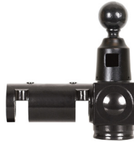
HSCB-R-PE Hangstraight, clamp style with BALL finial, twist-lock receptacle, photocell in decorative cap.