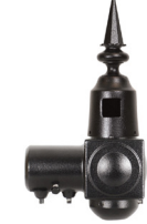
HSHS-R-PE Hangstraight, horizontal with SPIKE finial, twist-lock receptacle, photocell in decorative cap.