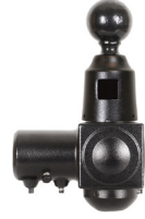
HSHB-R-PE Hangstraight, horizontal with BALL finial, twist-lock receptacle, photocell in decorative cap.