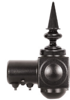
HSHS Hangstraight, horizontal, SPIKE Finial