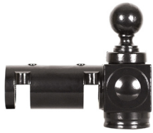
HSCB Hangstraight, clamp style, BALL finial

To slip fit 8" long by 2-3/8" OD on horizontal tenon.