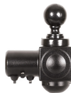
HSHB Hangstraight, horizontal, BALL finial

To slip fit 4" long by 2-3/8" OD on horizontal tenon.