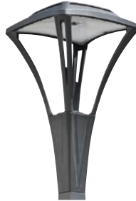
Millenia Post Top