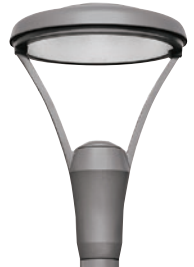
Solana Post Top